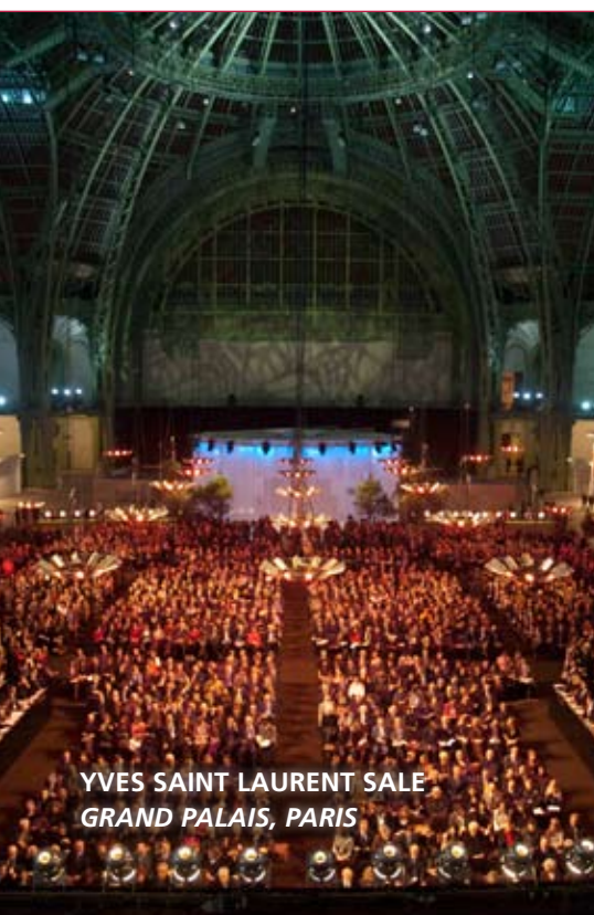
YVES SAINT LAURENT SALE GRAND PALAIS, PARIS

The triumphant sale of Yves Saint Laurent's private art collection, which took place February 23–25 in Paris, defies the global financial malaise to prove once again that high-quality properties will find willing buyers in any economic climate. More than 1,200 collectors and Christie's clients bid a record €374 million, well above the original €274 million estimate, at the Grand Palais auction site to set a new record for a single-owner collection. Fine homes from the affiliates of Christie's Great Estates were featured at this historic event, with magazines, property brochures, and an elegant