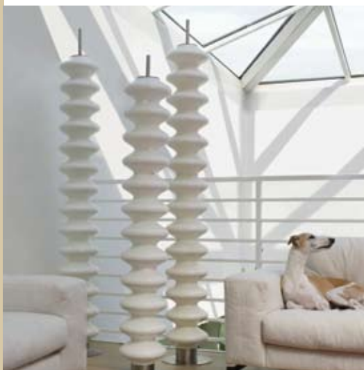
TUBES RADIATORI U.S. DISTRIBUTORS: ANISE, INC. PHONE 1 877 733 8116

High-Wattage Chairs: Once a museum piece, the Eudora fiberglass chair lights up any room—literally. Illuminated from within, the chair is available for purchase for US$2,949: www.gnr8.com .